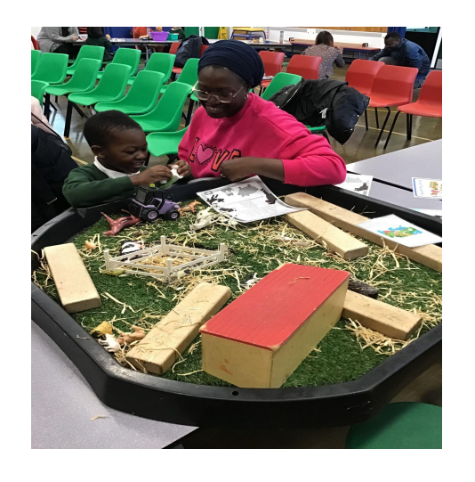
Hands on experiences!