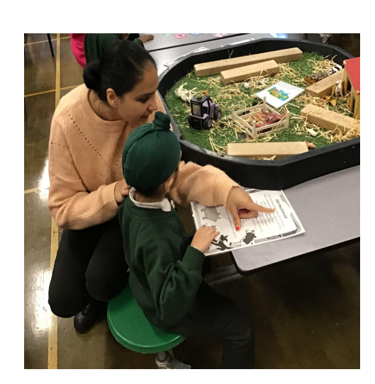
Thank you to all those who attended.